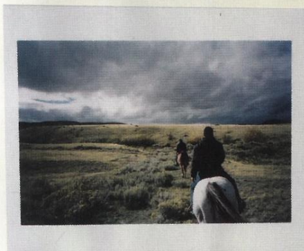
my horse was mila.